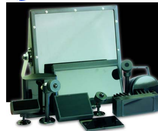
INFRARED ILLUMINATOR IR-98