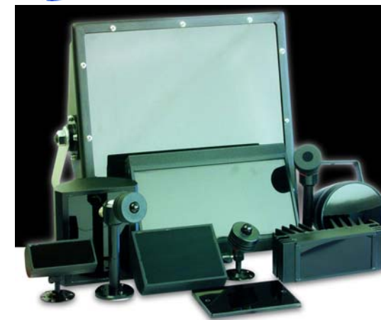
INFRARED ILLUMINATOR IR-98